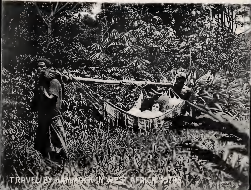
TRAVEL BY HAMMOCK IN WEST AFRICA 1925